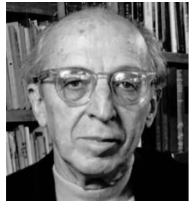
Born November 14, 1900, Brooklyn

The music vividly suggests the setting and action of the ballet: the pastoral countryside, the gathering of the farm folk, their barn dance, the frightening admonitions of the preacher, the shy affection of the young couple. The final section presents a set of variations on the Shaker hymn "Simple Gifts," which Copland made famous through his ballet score. All this, however, hardly conveys the achievement of Appalachian Spring . With this work, Copland captured not only an appealing frontier atmosphere but something greater: a transcendent feeling of rural life as a wellspring of purity and harmony with nature.