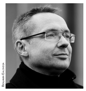
Born September 7, 1957, Oslo