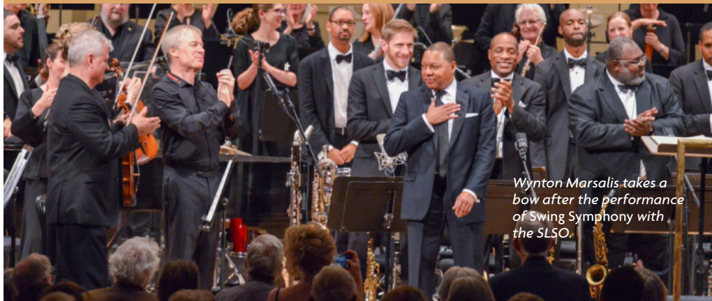
Wynton Marsalis takes a bow after the performance of Swing Symphony with the SLSO.

“As an orchestra, they were serious about it, and their participation in it was so positive.” – Wynton Marsalis