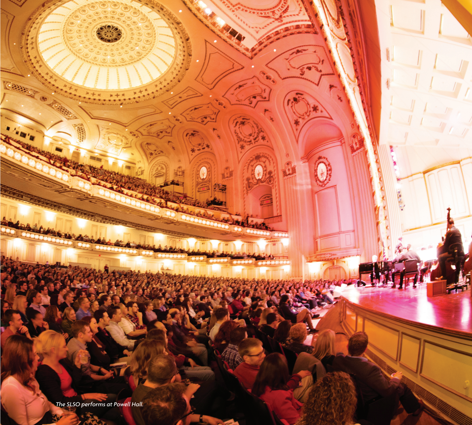
The SLSO performs at Powell Hall.