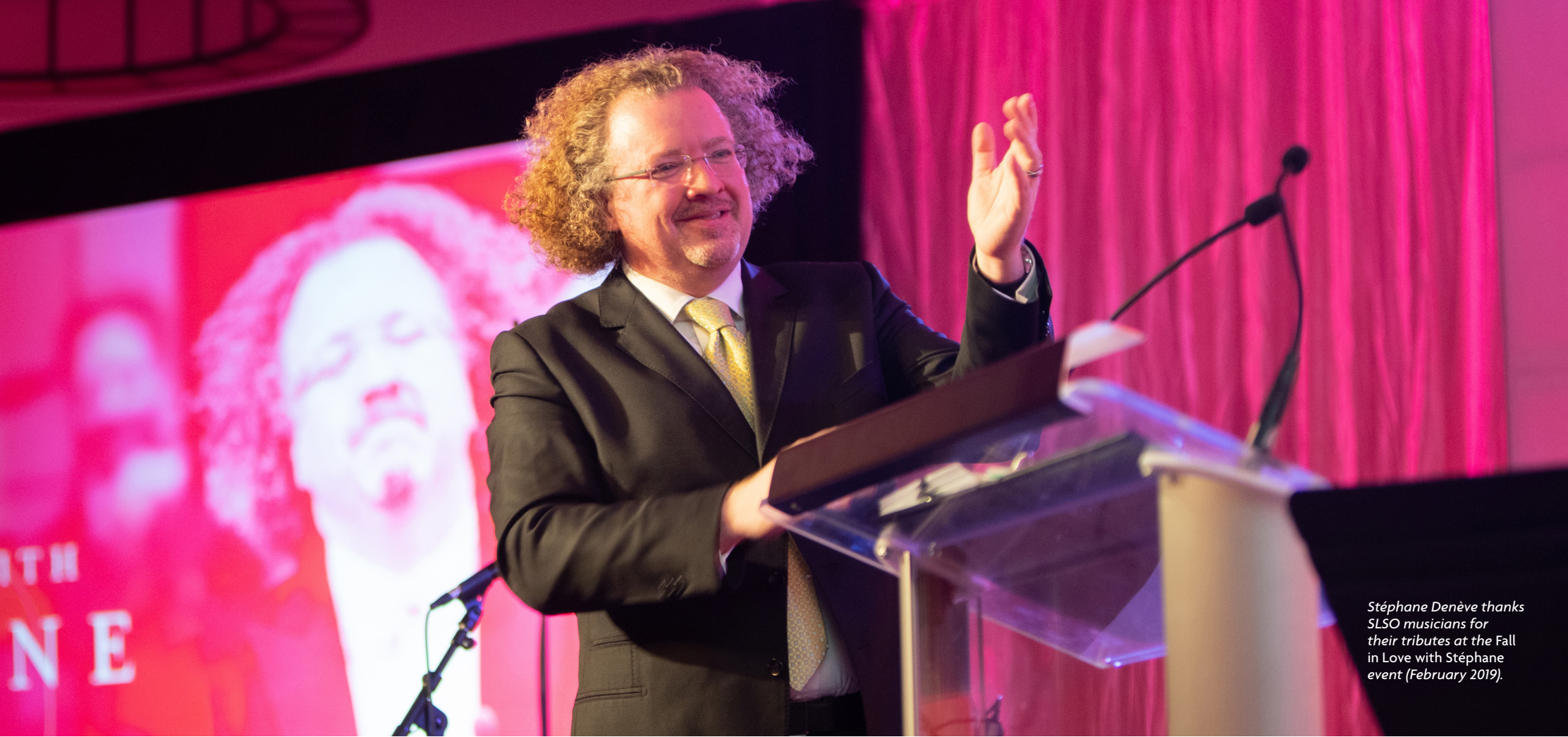
Stéphane Denève thanks SLSO musicians for their tributes at the Fall in Love with Stéphane event (February 2019).