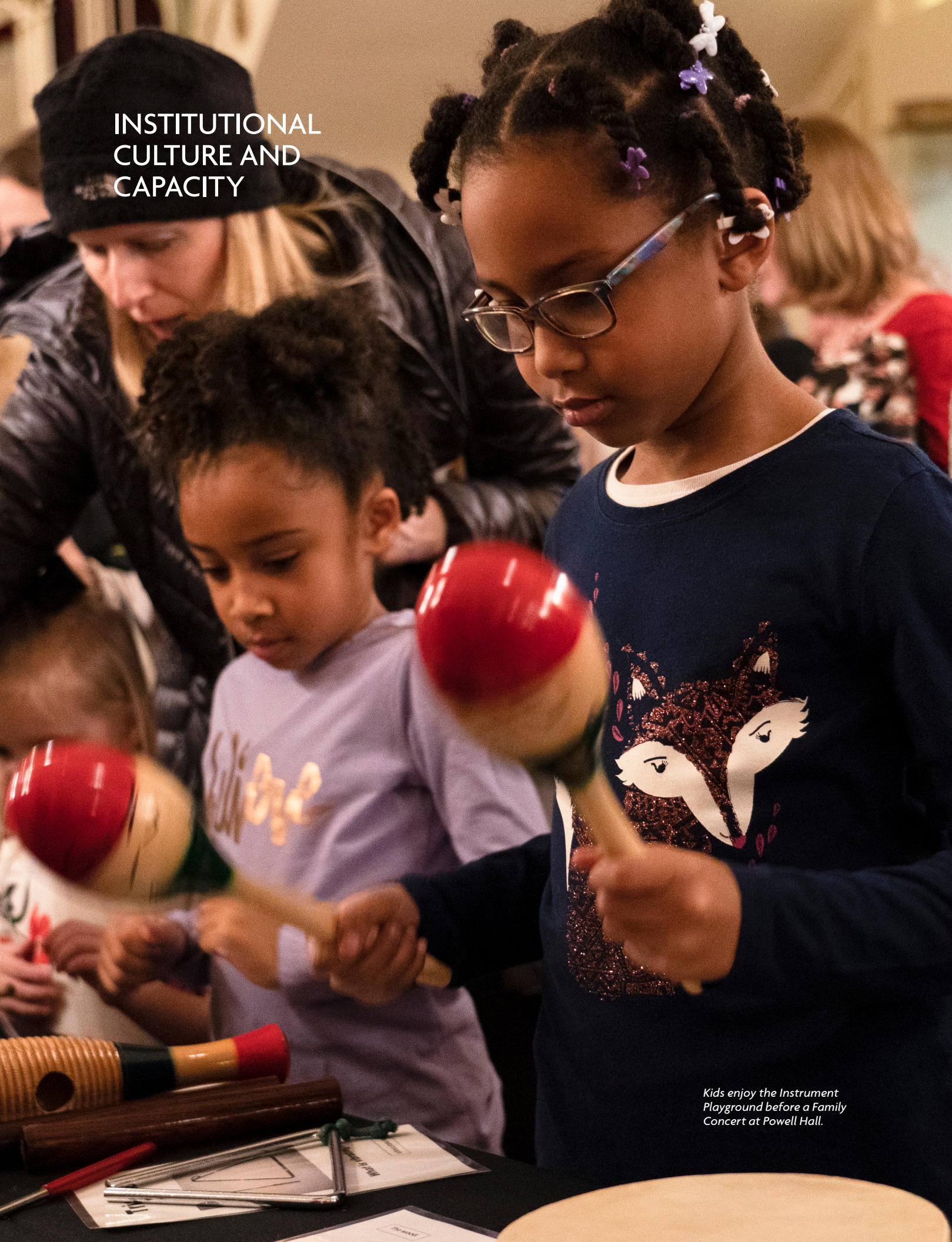
Kids enjoy the Instrument Playground before a Family Concert at Powell Hall.