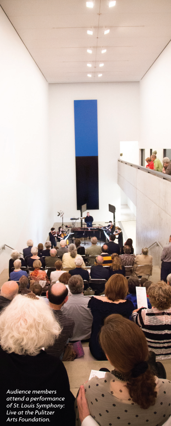
Audience members attend a performance of St. Louis Symphony: Live at the Pulitzer Arts Foundation.