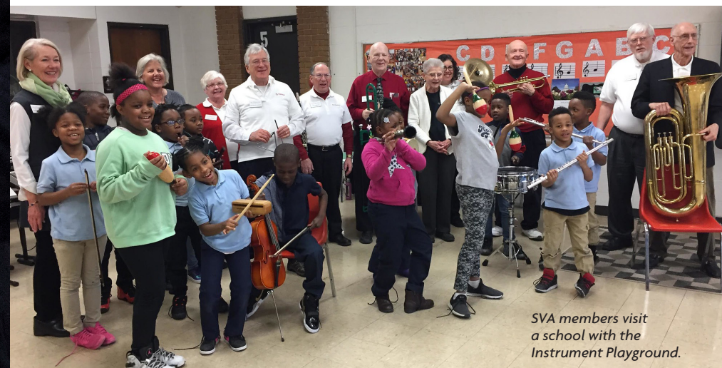
SVA members visit a school with the Instrument Playground.