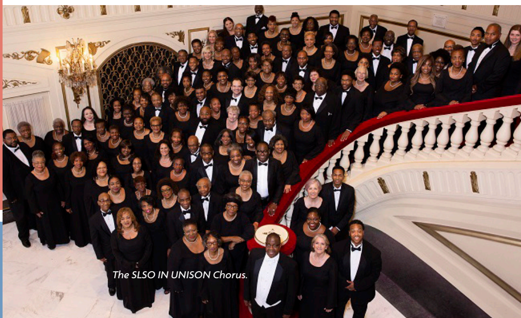
The SLSO IN UNISON Chorus.