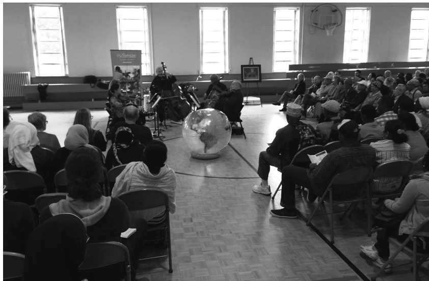
STL Symphony quintet performing at the International Institute