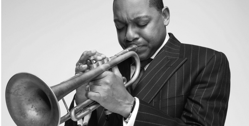
Wynton Marsalis most recently appeared with the SLSO for a gala performance in October 2012.