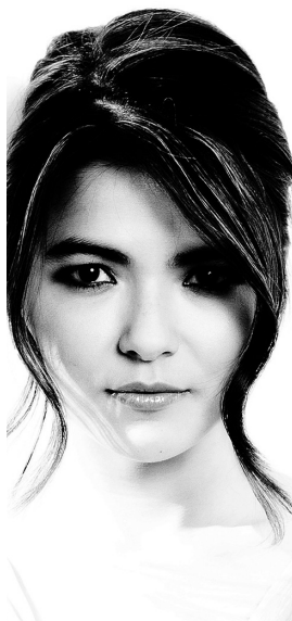
Karen Gomyo most recently performed Bartók's Rhapsody No. 1 and Ravel's Tzigane with the St. Louis Symphony in April 2008.

Karen Gomyo plays on the “Aurora, ex-Foulis” Stradivarius violin of 1703, which was bought for her exclusive use by a private sponsor.