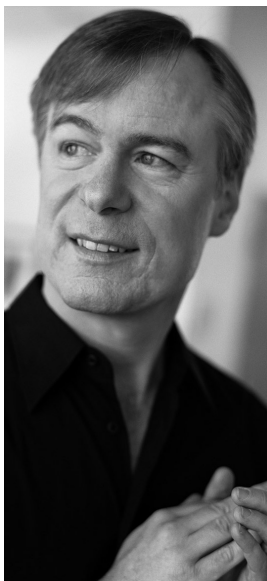
David Robertson conducts the St. Louis Symphony season finale, The Planets , May 6-8.