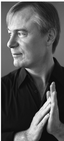
David Robertson returns to conduct the Metropolitan Opera's production of Janáček's Jenůfa in the 2016-17 season.