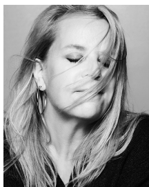
Mary Chapin Carpenter

The St. Louis Symphony Youth Orchestra season is sponsored by St. Louis Children's Hospital with additional support from the G.A., Jr. and Kathryn M. Buder Charitable Foundation and the ESCO Technologies Foundation.