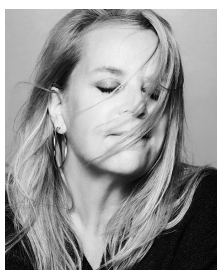
Mary Chapin Carpenter

The St. Louis Symphony Youth Orchestra season is sponsored by St. Louis Children's Hospital with additional support from the G.A., Jr. and Kathryn M. Buder Charitable Foundation and the ESCO Technologies Foundation.