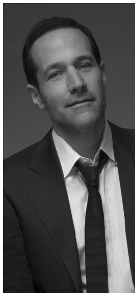
Jim Brickman most recently performed "Yesterday Once More...A Musical Tribute to the Carpenters" with the St. Louis Symphony in June 2011.

Brickman has received worldwide acclaim as a performer. His concerts have been enjoyed internationally and in over 125 cities across the U.S, including shows at Carnegie Hall and the White House. He recently performed on his eighth Jim Brickman Cruise.