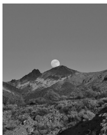
Moonrise

Supported by L'École Culinaire Presentation licensed by Disney Concerts and WDSMP Non-Theatrical © Disney