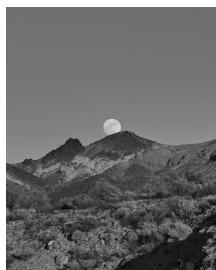
Moonrise

Presentation licensed by Disney Concerts and WDSMP Non-Theatrical © Disney