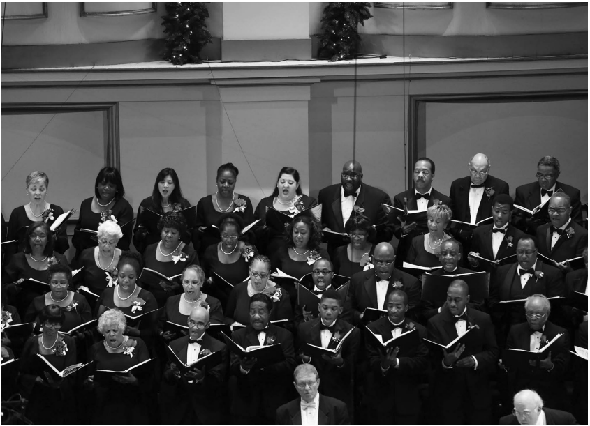
St. Louis Symphony IN UNISON Chorus

The St. Louis Symphony IN UNISON program was created in 1992 to provide high-quality musical resources to the African-American community, specifically through specialized outreach to member churches participating in the program. St. Louis Symphony musicians present free performances in at least half of the more than 40 member churches annually. Formed in 1994, the St. Louis Symphony IN UNISON Chorus is comprised of 120 singers from throughout the African-American community performing as part of the STL Symphony's season—all three concerts featuring the IN UNISON Chorus now attract capacity or near-capacity audiences. Additionally, the IN UNISON program encourages young people of diverse backgrounds to study music and has, through the years, recognized them for their talent and hard work through the awarding of scholarships and awards.