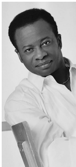
Larnelle Harris most recently performed with the St. Louis Symphony and IN UNISON Chorus in A Gospel Christmas in December 2011.

Larnelle Harris continues to tour worldwide. In addition to his numerous solo dates, Harris travels with various multi-artist tours including Compassion International Savior Tour, the Gaither Homecoming tour, the God of All Glory tour, and the Sandi Patty & Friends tour.