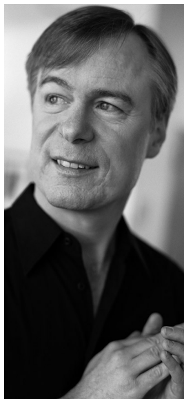
David Robertson conducts the Symphony's Thanksgiving weekend program, featuring Peter and the Wolf , November 27-29.

Born in Santa Monica, California, David Robertson was educated at London's Royal Academy of Music, where he studied horn and composition before turning to orchestral conducting. Robertson is the recipient of numerous awards and honors.