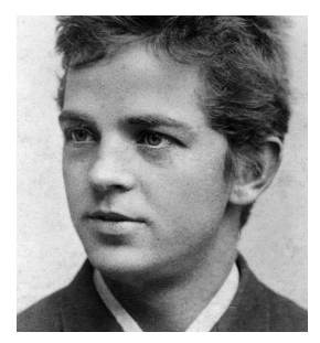
Born June 9, 1865, on the island of Fyn