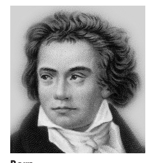
Born December 16, 1770, Bonn

Although Franz Liszt hadn't yet coined the term "symphonic poem," the Egmont Overture fits the definition. Dark, urgent, and dramatic, it isn't just sonic scene-painting; it tells a story and shapes our emotional responses. In Beethoven: Anguish and Triumph , Jan Swafford demonstrates how form follows function: "A stark orchestral unison begins the overture; then comes a darkly lumbering gesture in low strings, evoking the burden of oppression. The key is F minor, for Beethoven a tragic, death-tinted tonality." Although the play ends with the hero's execution, Goethe called for a "symphony of victory," and Beethoven delivered just that with his F-major