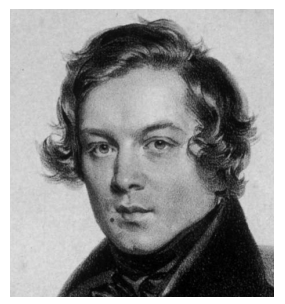
Born June 8, 1810, in Saxony